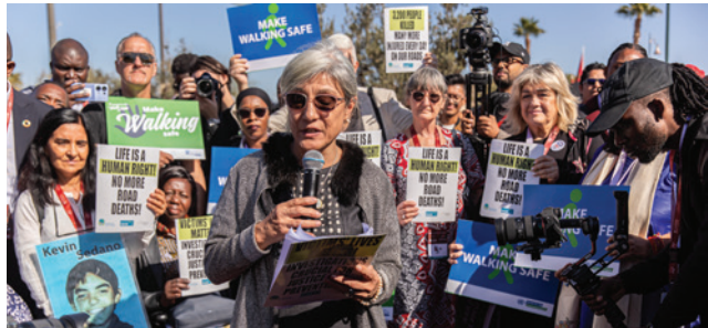
An NGO testimony at the Civil Society Call to Action

The most crucial element of the Ministerial Conference is what happens afterwards. The Alliance monitored the 25 commitments made by heads of delegation during the plenary sessions and will publish its analysis to support NGOs with their advocacy and accountability work. Our work will continue as we equip NGOs to keep their governments accountable through capacity building events, the Accountability Toolkit, Incubator program, and UN Global Road Safety Week.