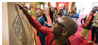
NGOs writing their messages on the safe mobility painting