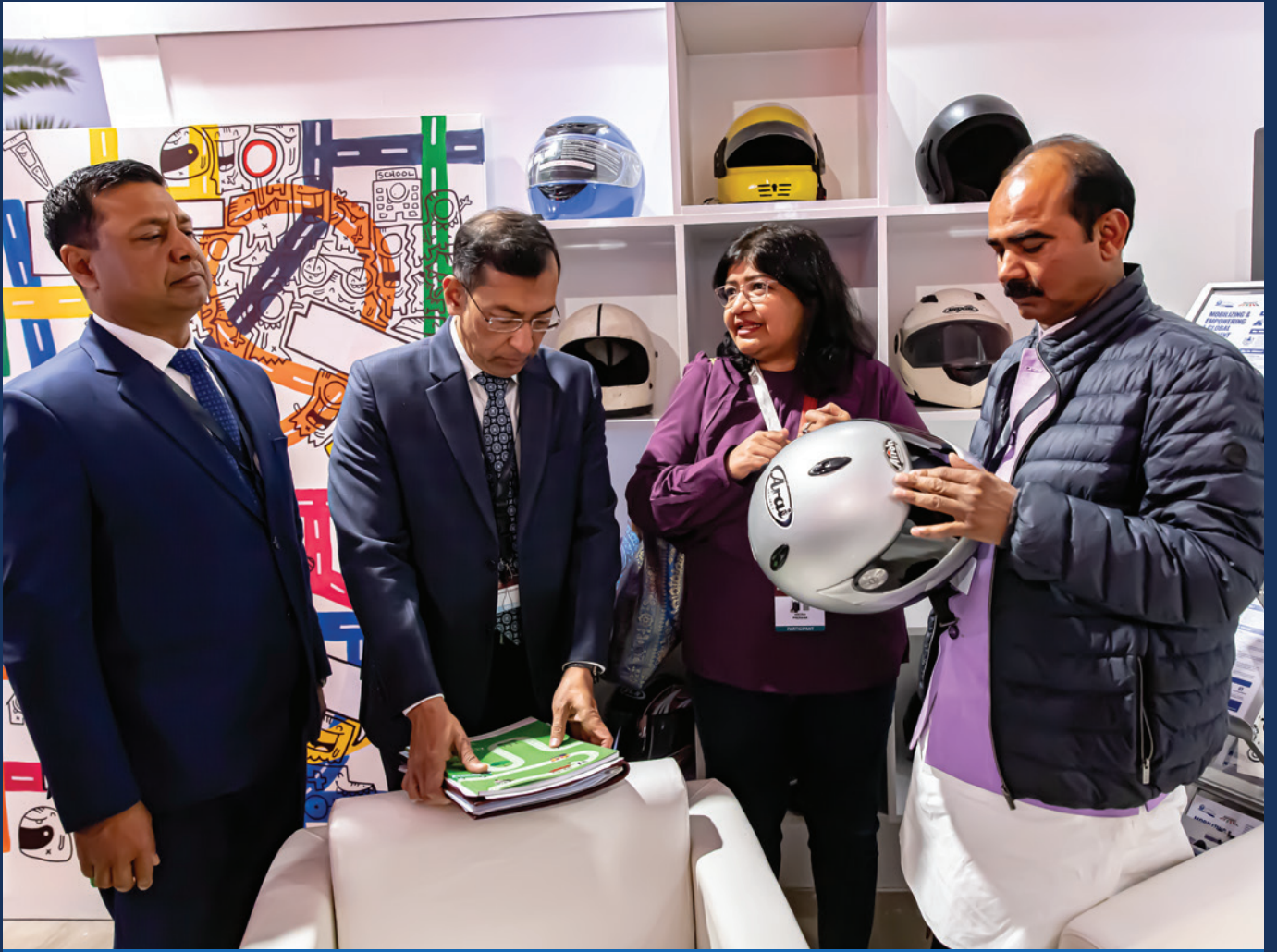
An Alliance NGO discusses safe helmets with the Minister of State and other delegation members from India