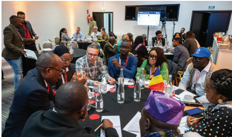
Discussions at the Africa Chapter regional meeting

Informal sessions for NGOs encouraged discussions about how to apply learnings and experiences from the Ministerial Conference back in their home countries. These sessions served to empower and mobilize NGOs' advocacy in their local contexts.