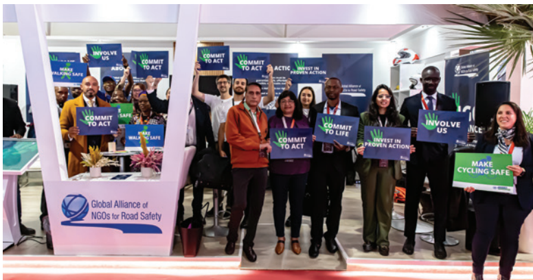
NGOs at the Alliance booth