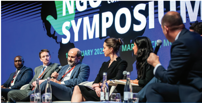
Panel discussion on sustainable financing at the NGO Symposium

The NGO Symposium, hosted by NARSA and WHO and supported by FIA Foundation, enabled the Alliance to set out its message of commitment and accountability ahead of the Ministerial Conference. High-level keynote speakers commended the role of NGOs and two panels explored how to make commitments actionable through the role of different stakeholders and sustainable road safety financing.