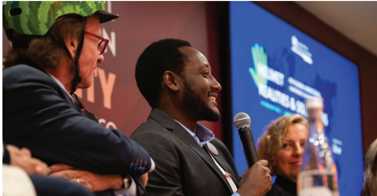
Panel discussion at the side event

Experts who contributed to the white paper Making safe helmets a reality for all , joined a side event to back up the publication discussed the key messages and challenges presented in it, including helmet standards, enforcement, manufacture, and importation, and solutions that different stakeholders can put into action. Two NGOs shared the local perspective from their countries, based on community consultations included in the white paper.