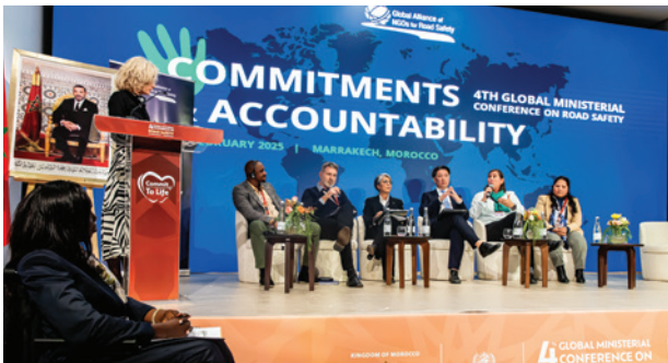
Panel discussion at the parallel session on Commitments and Accountability

331 new social media followers during the Ministerial Conference and during the week after