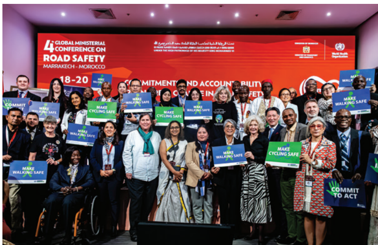
Participants at the parallel session

The parallel session featured powerful testimonies and stage-setting to show that people and their journeys must be the highest consideration in accountability. A panel discussion explored accountability for implementing commitments and the essential elements and tools needed to achieve this.