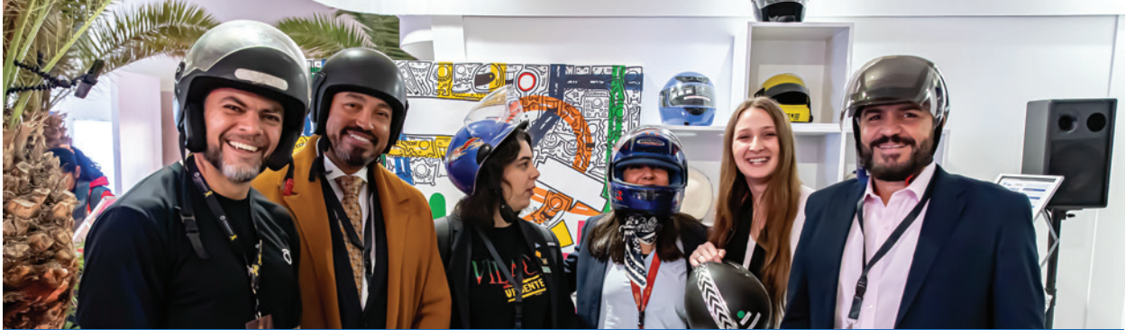
Welcoming the Brazilian delegation to the Alliance booth

The Ministerial Conference was an opportunity for NGOs to engage with their Ministers, strengthen existing relationships and build new ones, and continue their advocacy for evidence-based interventions. Speaking roles at Alliance events further helped to increase their credibility.