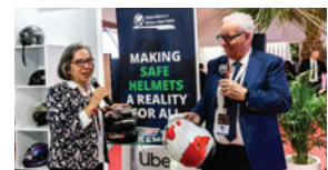
A helmet head-to-head