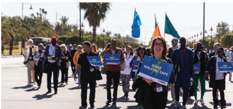
NGOs at the #CommittoLife Walk and Ride

In support of the upcoming UN Global Road Safety Week on safe walking and cycling, the Alliance and YOURS-Youth for Road Safety organized the #CommittoLife Walk and Ride. It was kicked off by Etienne Krug, WHO, announcing the theme of the week and linking the testimonies from the Call to Action to the right to walk and cycle safely. This colorful event demonstrated the need to make these active, climate-friendly forms of transport safe.