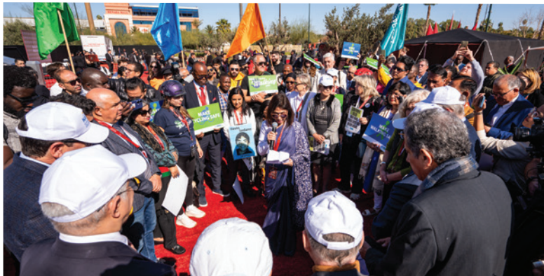
NGO reading the Call to Action at the community event

The Alliance and the Global Youth Coalition called for urgent action to make mobility safe at a community event organized by NARSA. A youth advocate and NGO gave their testimonies and the Alliance Call to Action was read out.