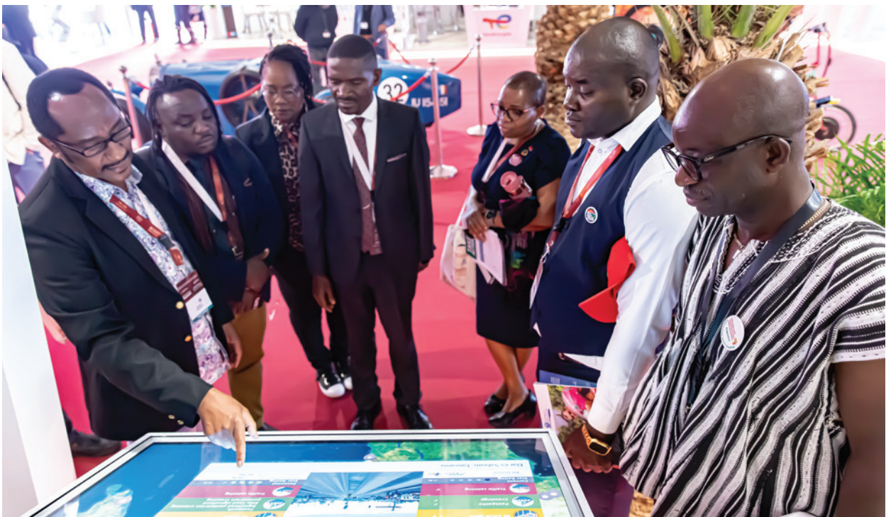
Minister and delegation from Malawi exploring the Mobility Snapshot map