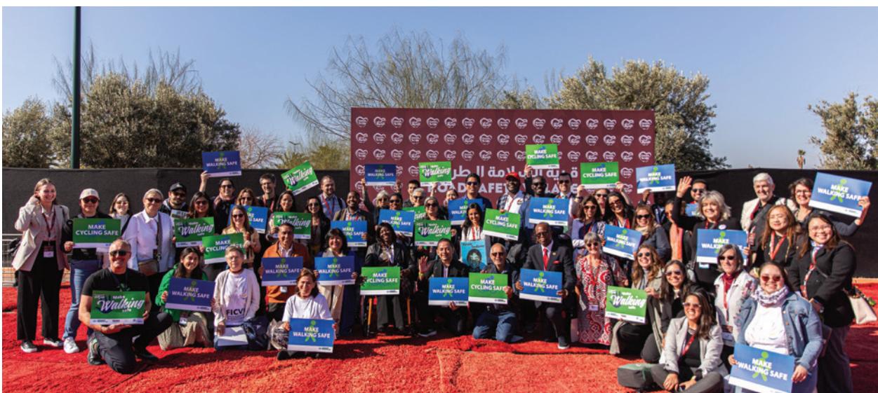
NGOs at the Civil Society Call to Action