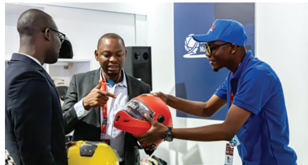
NGOs and participants comparing standard and non-standard helmets at the Alliance booth