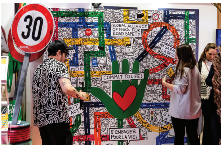
Yesterman working on the safe mobility painting

The Alliance's activities and Call to Action during the conference culminated in NGOs, presenting the painting created at the booth to the Minister, on behalf of the Government of Morocco. Before the presentation, NGOs wrote their messages on the back of the painting.